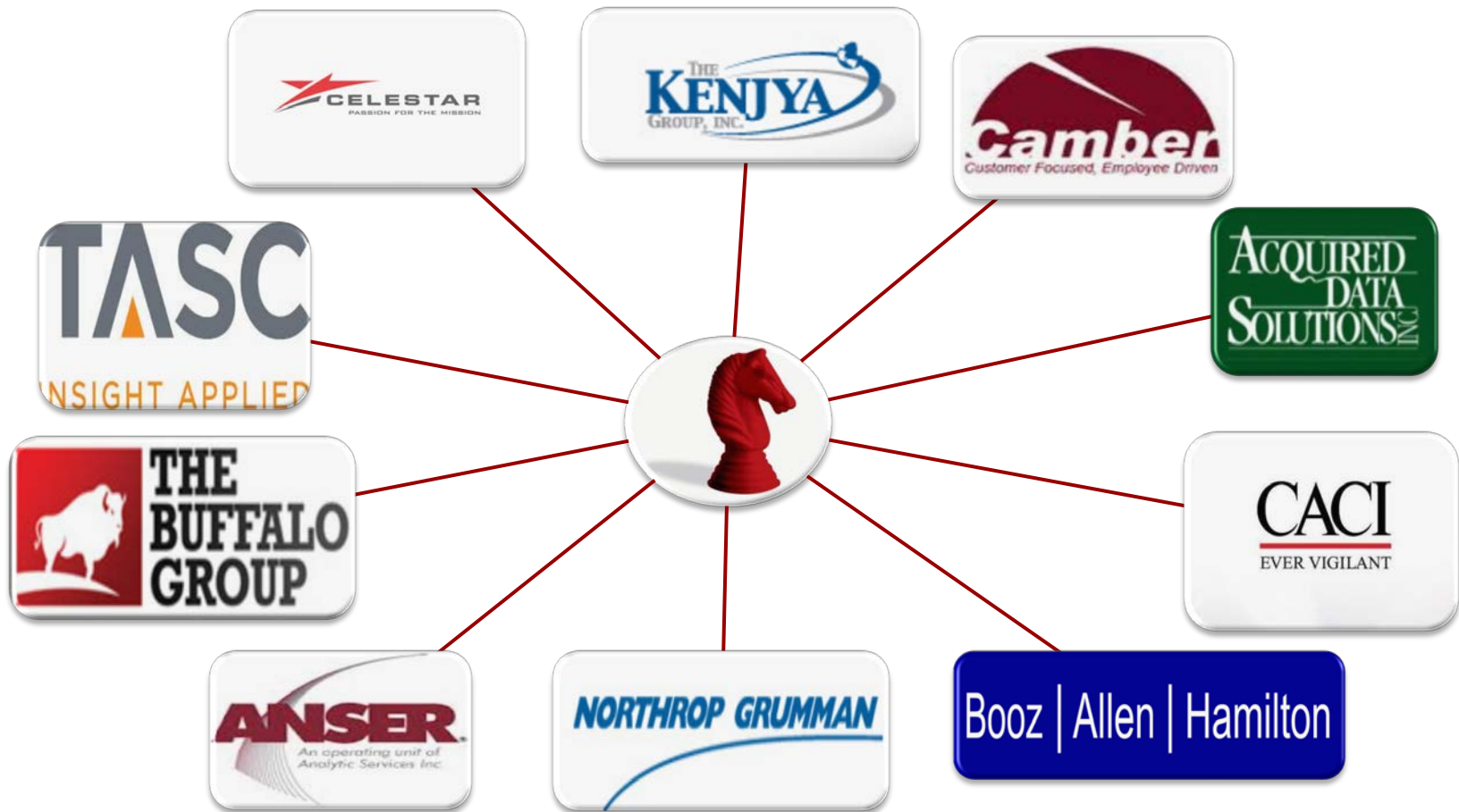
Figure 1.2 illustrates current and previous SDS contract partners